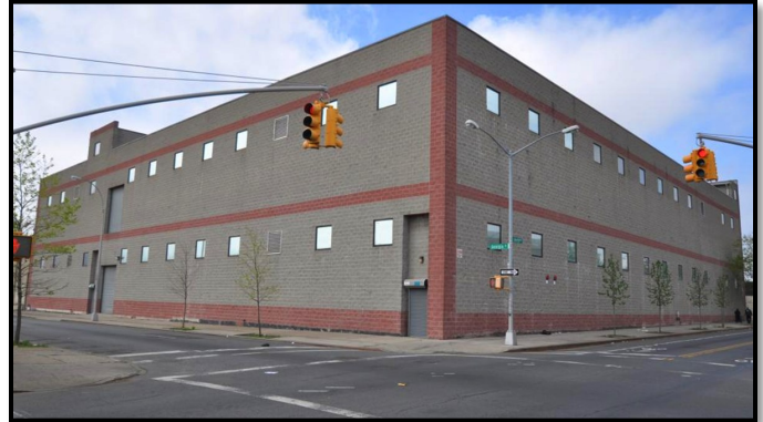
300 LIBERTY AVENUE