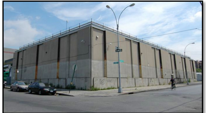
317 GLENMORE AVENUE

FOR ADDITIONAL INFORMATION CONTACT EXCLUSIVE AGENT: